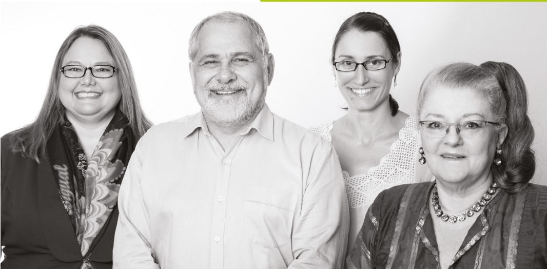
Student Success Coaching Program

The Student Success Coaching Program: a targeted institutional strategy for supporting the early engagement, academic success and retention of commencing at-risk students.