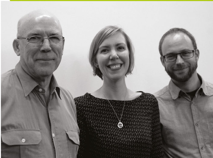
Agricultural Sciences Teaching Team

Power of the personal: Development of a flipped 1st-year animal and agricultural sciences subject offering an engaging and authentic curriculum to diverse student cohorts.