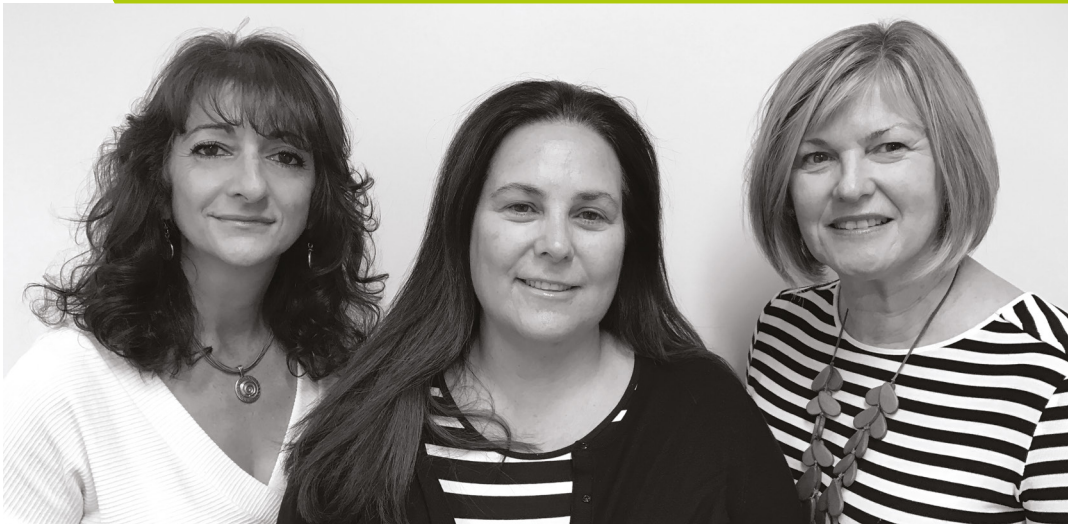
The BEST Team

For the BEST approach: enhancing learning and teaching through a sustained colleague development program.