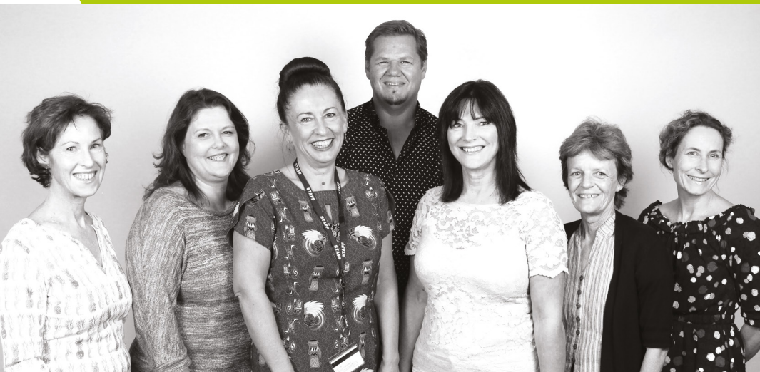
Communication and Thought Core Course team

For a collaborative team approach that provides an exemplary first tertiary education experience through constructively-aligned curriculum and resources informed by scholarship and evaluative practice.