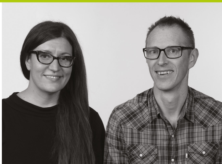
RMIT Cinema Studies major team

For a creative, adaptive and inclusive approach that enables diverse chemical engineering students to become successful learners and develop into ethical professionals.