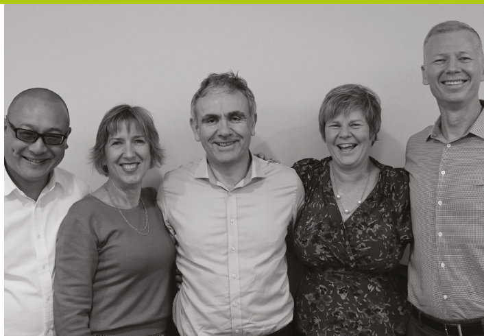
The University of Sydney Health Collaboration Challenge Team

For enabling student enquiry in diagnostic imaging through an innovative and media-rich learning environment that provides multi-stage feedback on learning activities.