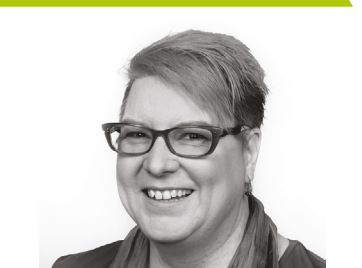
Dr Celeste Lawson

For developing a landmark curriculum for sonographer education which engages, empowers and enables undergraduate students to apply practical skills in the clinical context.