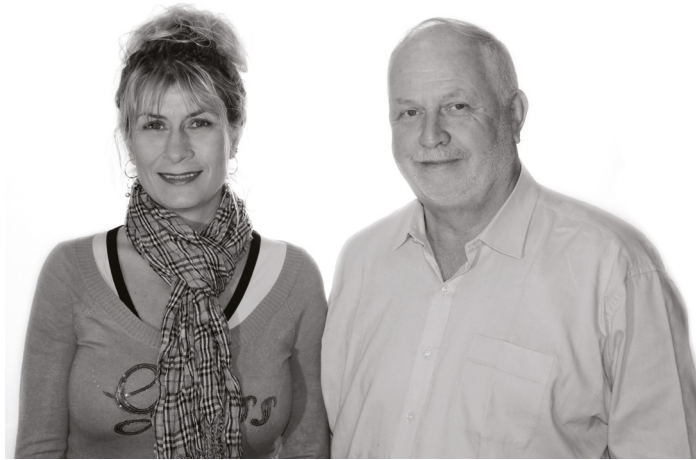
UniSA HDR Supervisor Development Team

Sustained commitment to improve learning and self-confidence through peer learning strategies which support a scaffolded approach to deep scientific learning.