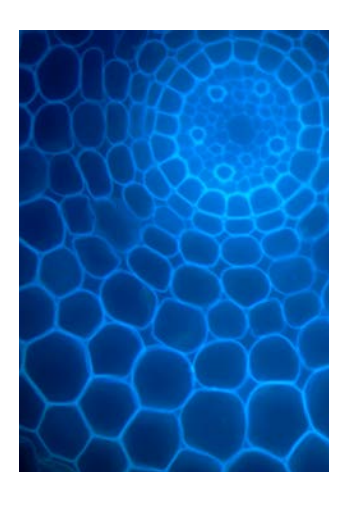
Image on front cover: From Australian Microscopy and Microanalysis Research Facility. Depicts Antarctic 'hair grass' root cross-section, showing the arrangement of cells. These are highly efficient at taking up essential nitrogen nutrients, which means that they are able to out-compete other plants as the temperature in Antarctica rises. Visualised using confocal microscopy by Dr Peta Clode, University of Western Australia.

Size: the larger cells are about 30 micrometres across.