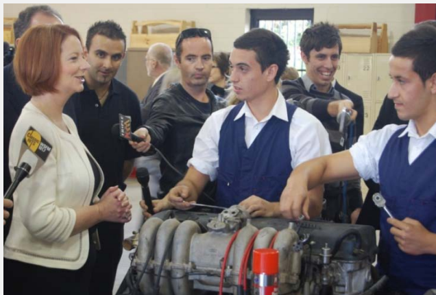
The Prime Minister Julia Gillard visiting Southern Cross Catholic Vocational College on 4 May 2011.

The curriculum at the college is based around vocational training, with English as the only compulsory subject. The vocational courses offered include automotive, construction, entertainment, hairdressing, beauty therapy, media and business services. The students receive a minimum Certificate II in their vocational training and this training is recognised as part of their Higher School Certificate program.