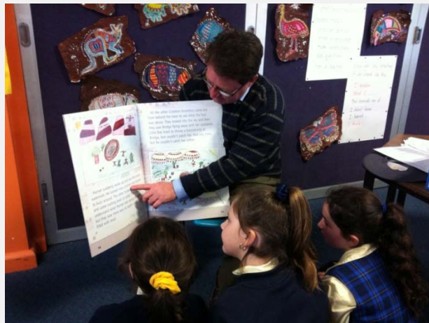
Embedding local Aboriginal cultural knowledge in literacy lessons at St Francis of Assisi Primary School, Warrarong

The school has identified the need to continue their professional learning to improve their local cultural knowledge.