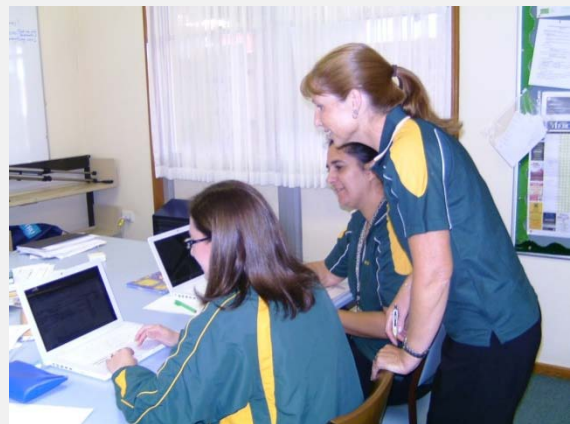
Teachers and students at Warilla Public School engaging in TOWN learning activities.