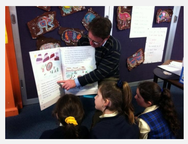
Embedding local Aboriginal cultural knowledge in literacy lessons at St Francis of Assisi Primary School, Warrawong

A number of staff participated in 'inschool' workshops on cultural awareness and one staff member has undertaken an Aboriginal cultural immersion program.