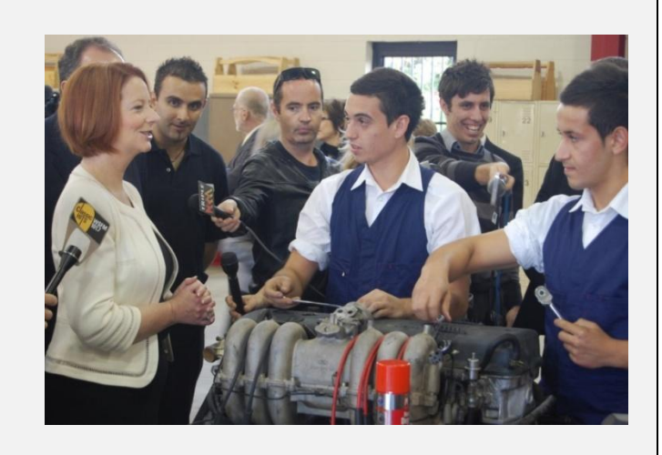
The Prime Minister Julia Gillard visiting Southern Cross Catholic Vocational College on 4 May 2011.

The curriculum at the college is based around vocational training, with English as the only compulsory subject. The vocational courses offered include automotive, construction, entertainment, hairdressing, beauty therapy, media and business services. The students receive a minimum Certificate II in their vocational training and this training is recognised as part of their Higher School Certificate program.